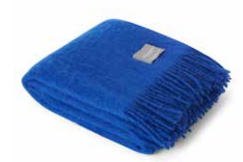
4160 Mohair Blanket Indigo