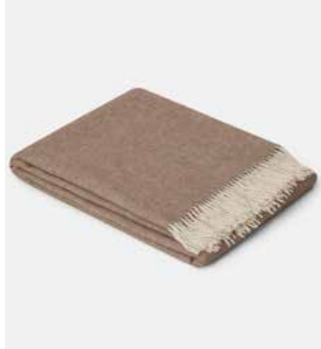
5044 Recycled Blanket Beige