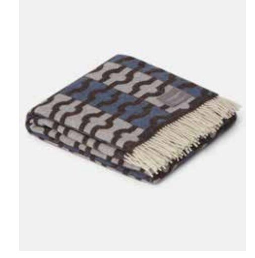
9118 Wallpaper Blanket Blue, Brown & Offwhite