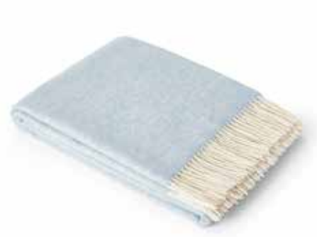
9131 Merino & Cashmere Wool Two Tone Light Blue