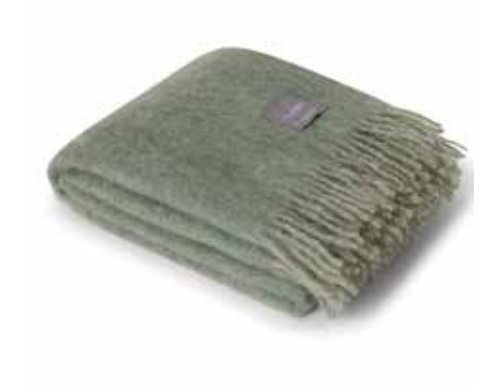
4113 Mohair Blanket Sea Foam & Green Bay Melange