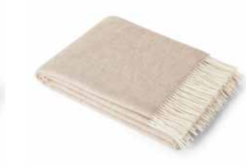
9132 Merino & Cashmere Wool Two Tone Light Taupe