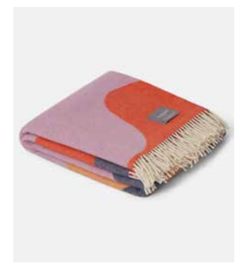
9116 Wave Blanket Coral, Ocra, Blue & Lilac Waves