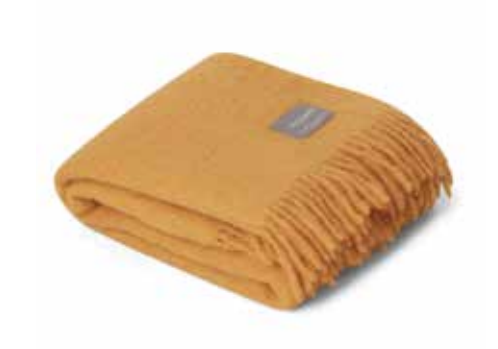
4168 Mohair Blanket Ocra