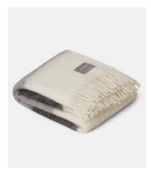
4172 Mohair Blanket Black, Skiffer & White Stripe