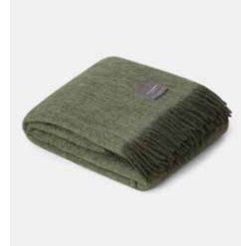
4117 Mohair Blanket Moss & Green Melange