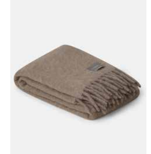
4109 Luxury Kid Mohair Blanket Brindle