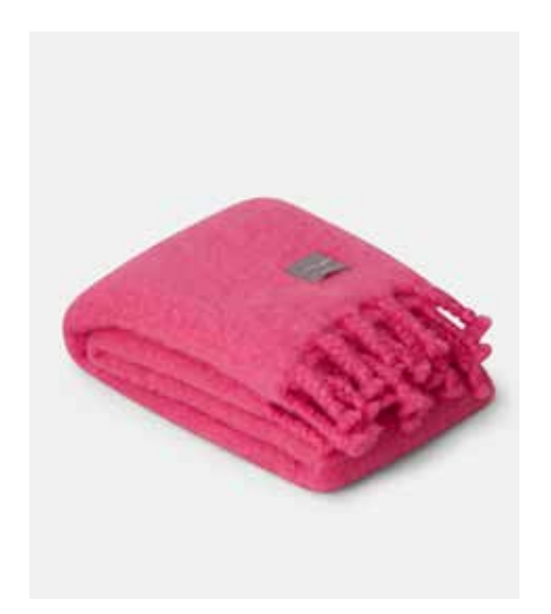
4200 Mohair Deluxe Blanket Pion

Deluxe Mohair Blanket is made from 88% Mohair, 8% Wool and 4% Nylon binding. Size: 140 x 220 cm.