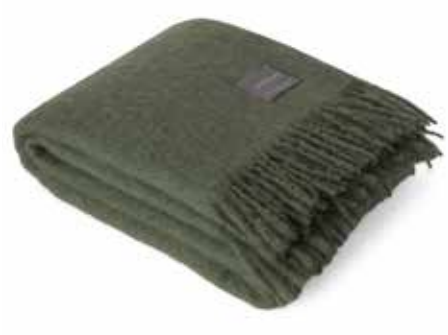
4178 Mohair Blanket Olivine