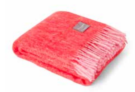
4175 Mohair Blanket Pelagon & Red Melange