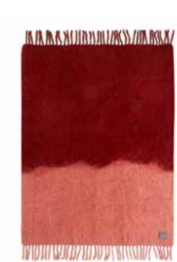
4206 Luxury Kid Mohair Dip Dyed