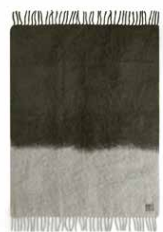
4205 Luxury Kid Mohair Dip Dyed