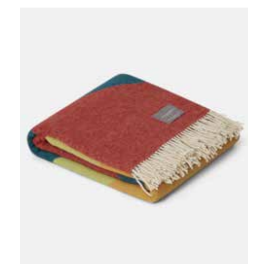
9117 Wave Blanket Lime, Ocra, Petrol & Wine Waves

Wallpaper & Wave Blanket are made of 70% Recycled Wool, 27% Polyamide and 3% Other Fibre. Size 140 x 180 cm. Wallpaper and Wave Blankets are designed by the architect & design company Egnell & Allard and manufactured by Stackelbergs in Italy.