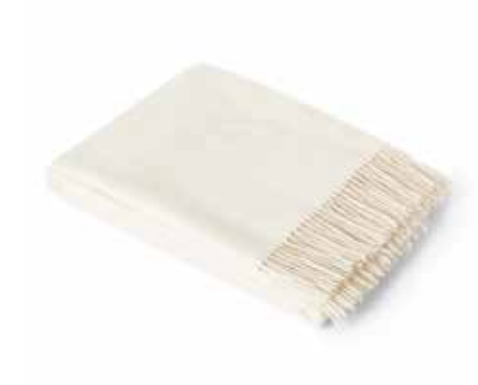
9134 Merino & Cashmere Wool Two Tone Offwhite