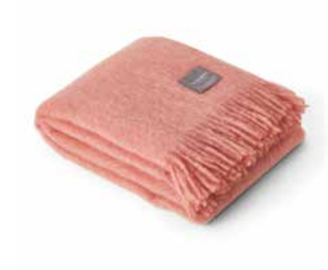
4174 Mohair Blanket Antique Rose