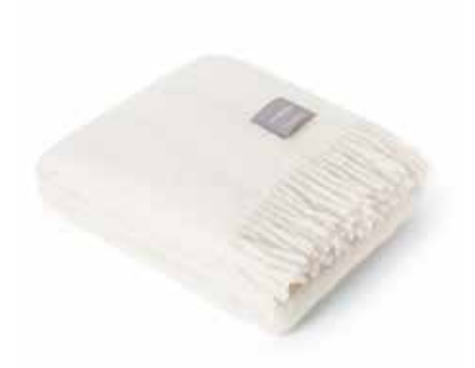
4179 Mohair Blanket Reflection White