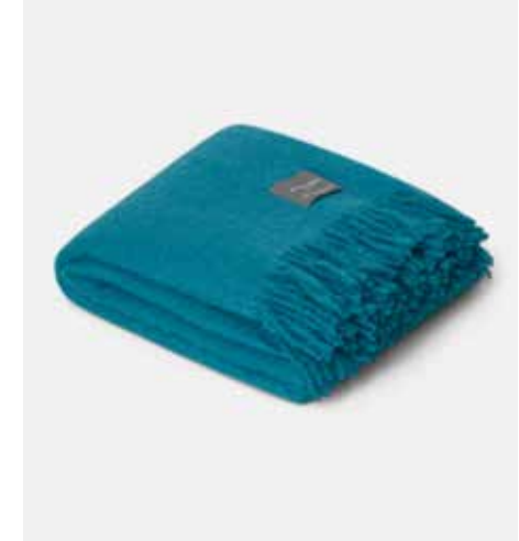
4068 Mohair Blanket Emerald Green