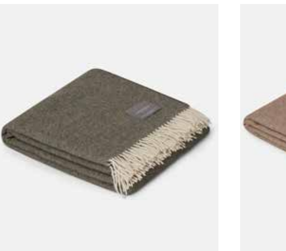
5041 Recycled Blanket Green