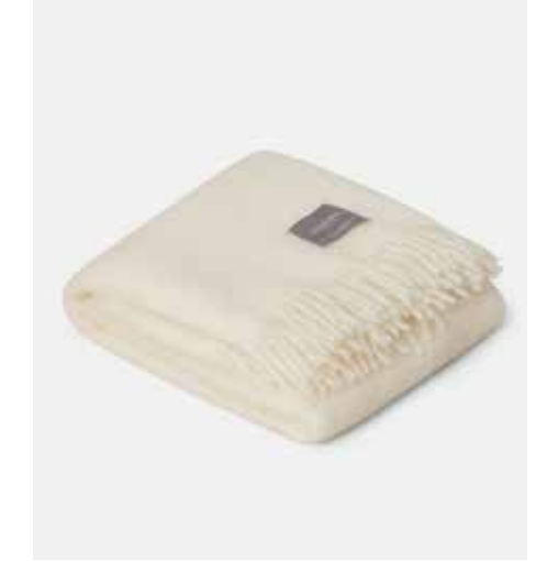
4142 Mohair Blanket Bright White