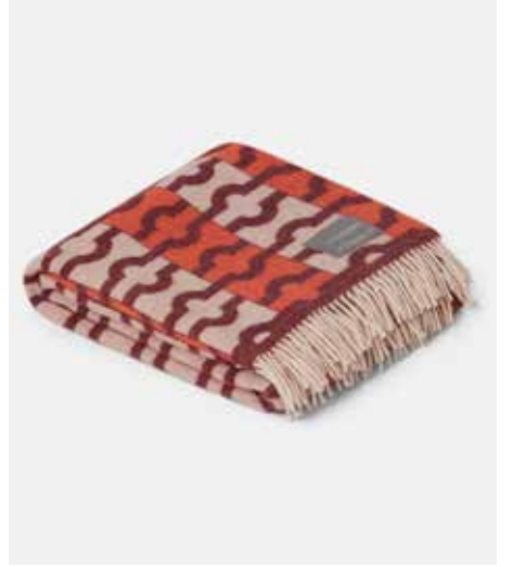
9120 Wallpaper Blanket Orange, Bordeaux & Offwhite