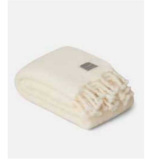
4203 Mohair Deluxe Blanket White