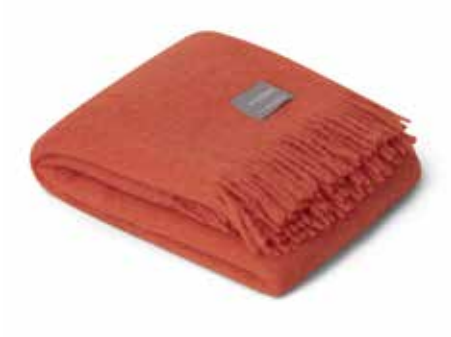
4166 Mohair Blanket Jaffa Orange