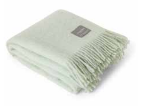
4158 Mohair Blanket MInt