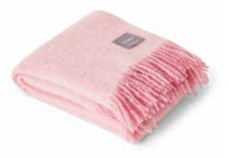
4136 Mohair Blanket Pelagon & Pink Melange