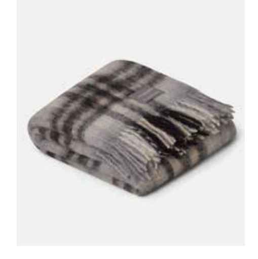
4173 Mohair Blanket Black, Skiffer & White Check