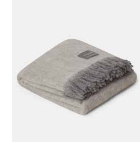
4042 Mohair Blanket White & Skiffer Melange