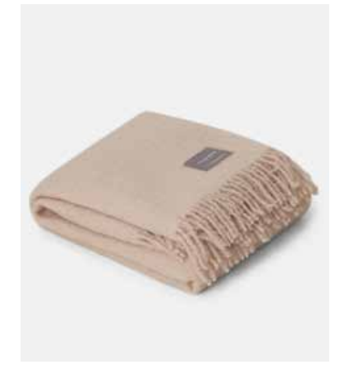
4071 Mohair Blanket Portabello