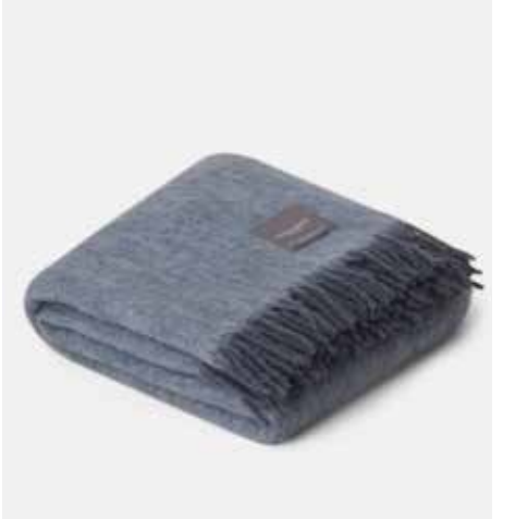
4140 Mohair Blanket Tide & Blue Fog Melange