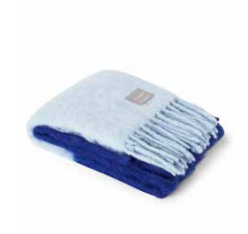
Blue & Mazarine

Air and brush your blanket regularly. The blankets must be dry cleaned.