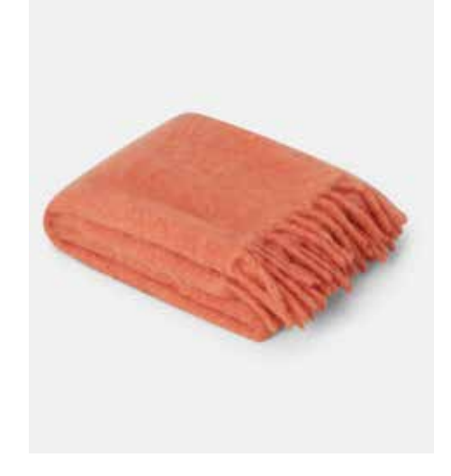
4201 Luxury Kid Mohair Blanket Salsa