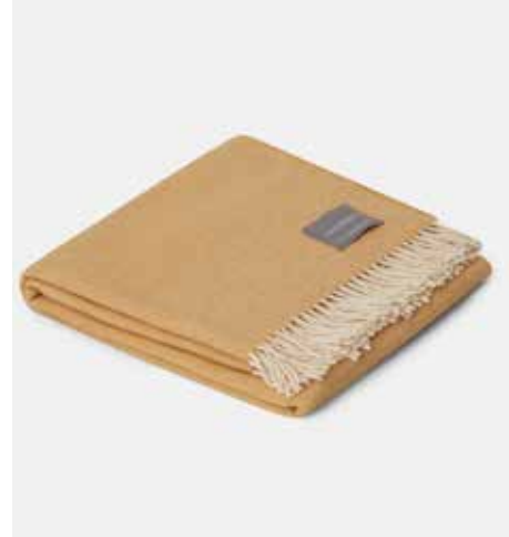
5045 Recycled Blanket Mustard