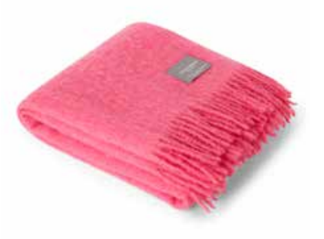
4007 Mohair Blanket Pion