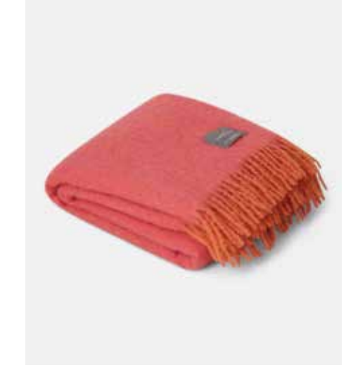
4006 Mohair Blanket Orange & Pion Melange