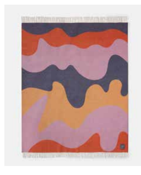
9116 Wave Blanket Coral, Ocra, Blue & Lilac Waves Pattern