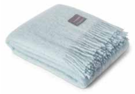
4118 Mohair Blanket Dusky Blue