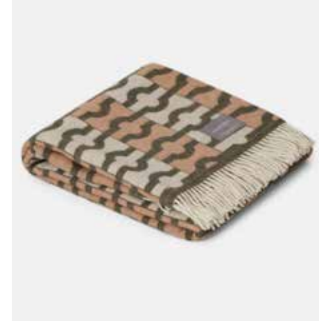
9119 Wallpaper Blanket Beige, Moss & Offwhite