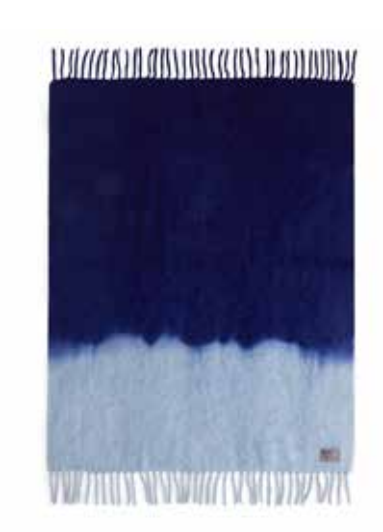
4204 Luxury Kid Mohair Dip Dyed