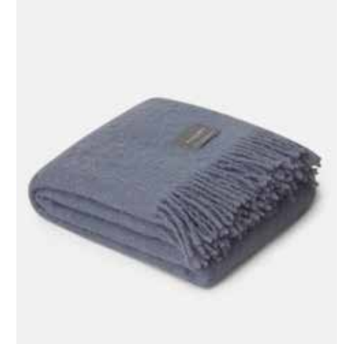
4013 Mohair Blanket Pilaster