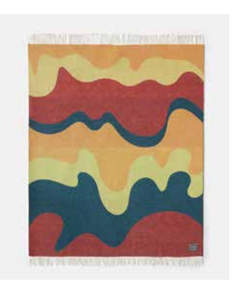
9117 Wave Blanket Lime, Ocra, Petrol & Wine Waves Pattern