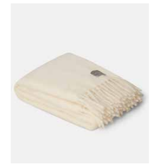
4100 Luxury Kid Mohair Blanket Pure White