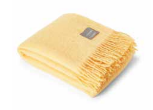
4137 Mohair Blanket Golden Yellow