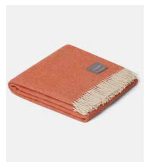
5046 Recycled Blanket Orange