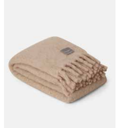
4202 Mohair Deluxe Blanket Sand