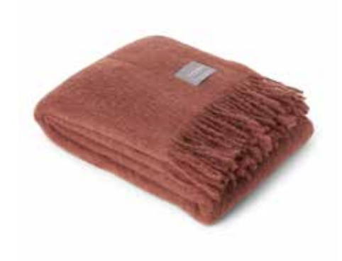
4176 Mohair Blanket Mahogny