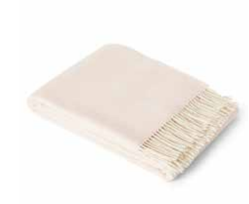
9133 Merino & Cashmere Wool Two Tone Light Rosé