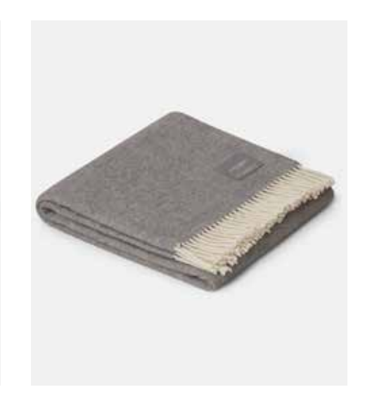
5043 Recycled Blanket Light Grey