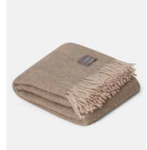
4141 Mohair Blanket Light Taupe & Brindle Melange