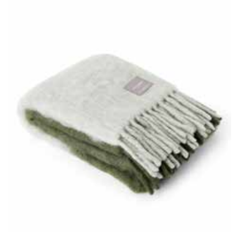
Sage & Olivine