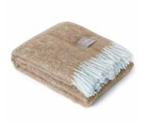
4177 Mohair Blanket Dusky Blue & Dark Brown Melange