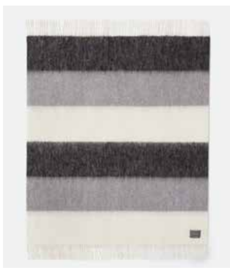
4172 Mohair Blanket Black, Skiffer & White Stripe Pattern