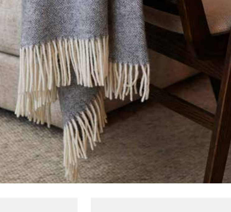
5040 Recycled Blanket Blue