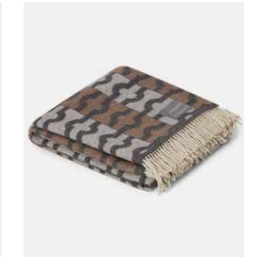
9121 Wallpaper Blanket Dark Grey, Brown & Light Grey