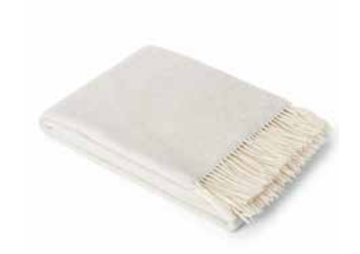
9130 Merino & Cashmere Wool Two Tone Light Grey